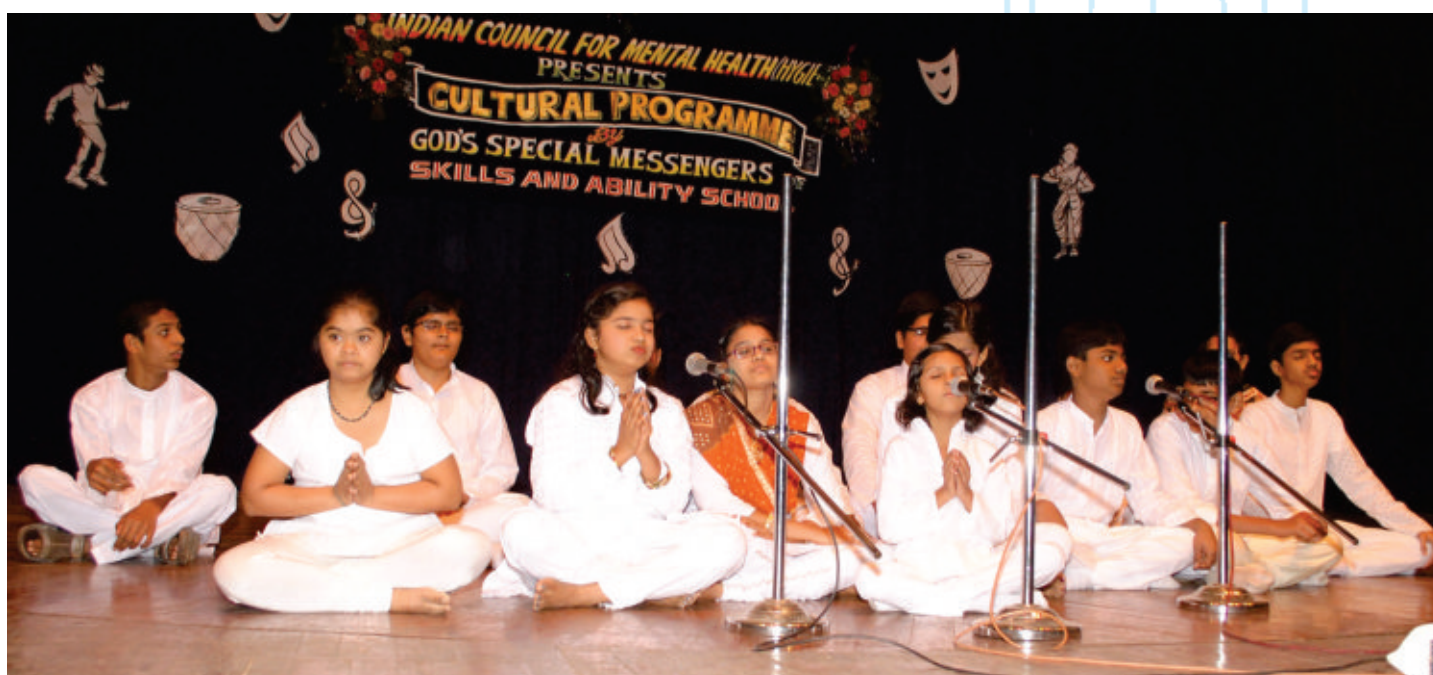
Annual Day Function : Children performing on stage