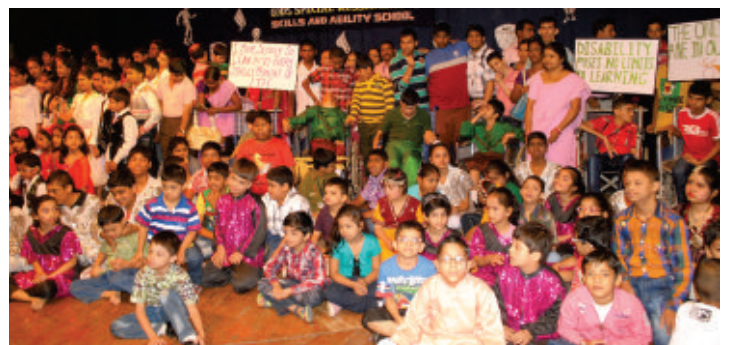
Annual Day Function : Children performing on stage