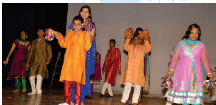
Annual Day Function : Children performing on stage