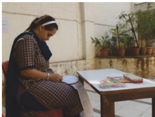
Participants of the Ability Competition